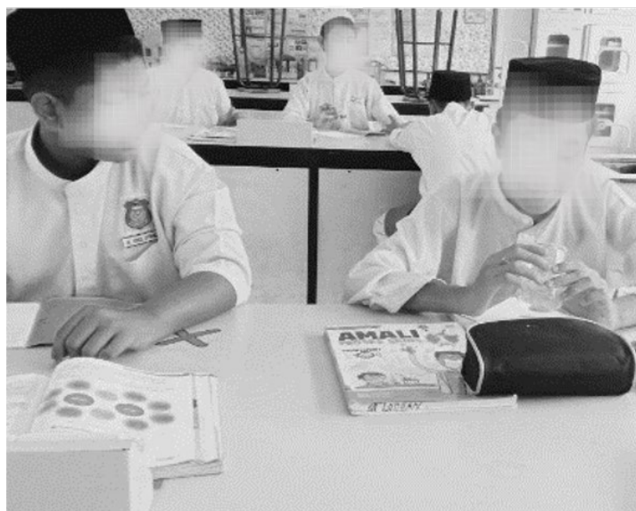
Figure 3. Pupils make observations on the ice used as the focus of the question

(Rothstein & Santana, 2017) that the teacher-researcher introduced to pupils was less helpful to them constructing investigable questions than she had initially thought.